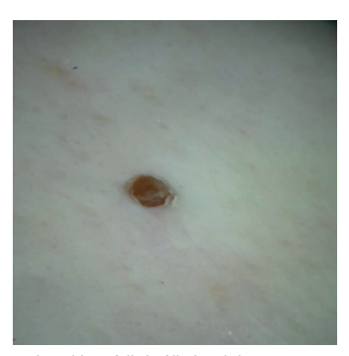
Widened hair follicle filled with keratin

Superficial, follicular papules with a central, roundish opening filled with a keratotic plug, generally overlying a regular flat epidermis