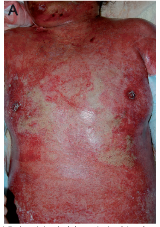
Fig.\ 1. Erosive and ulcerative lesions on the chest 7 days after starting cefozopran.