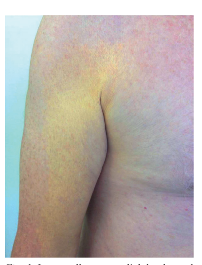
Fig. 1. Large yellow, very slightly elevated plaque in a vertical linear array of the right armpit.

A man in his late 60s presented with multiple asymptomatic yellow, slightly elevated plaques symmetrically distributed over the periorbital areas, neck, proximal trunk, medial aspect and flexural folds of the arms, progressively enlarging over 6 months (Fig. 1). He was otherwise generally well. No lymphadenopathies or hepato-splenomegaly were detected. Blood tests revealed raised erythrocyte sedimenta-