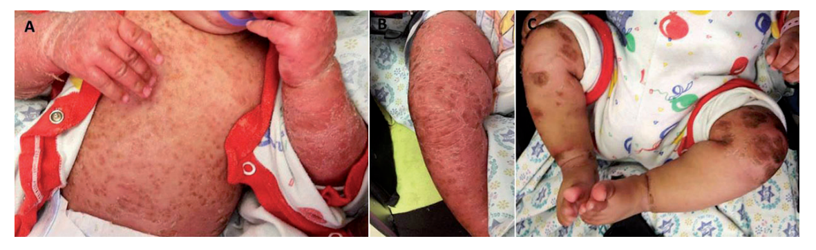
Fig. 2. (A, B) Widespread erythematous and crusted papules and plaques with marked desquamation in patient 2. (C) Crusted plaques with desquamation in patient 3.