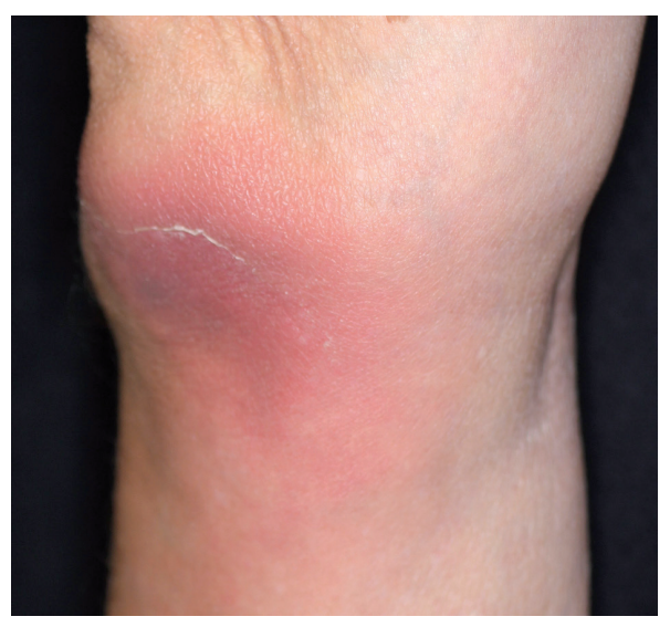
Fig. 1. Clinical features of the patient's eruption: an indurated erythematous nodule is visible on the right knee.