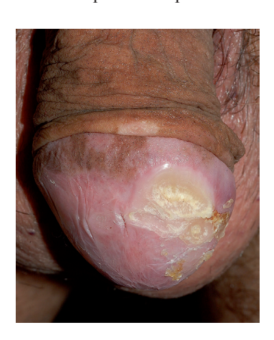
Fig. 1. Adherent, intensely keratotic lesions over a silvery scaly patch on the glans penis.

What is your diagnosis? See next page for answer.