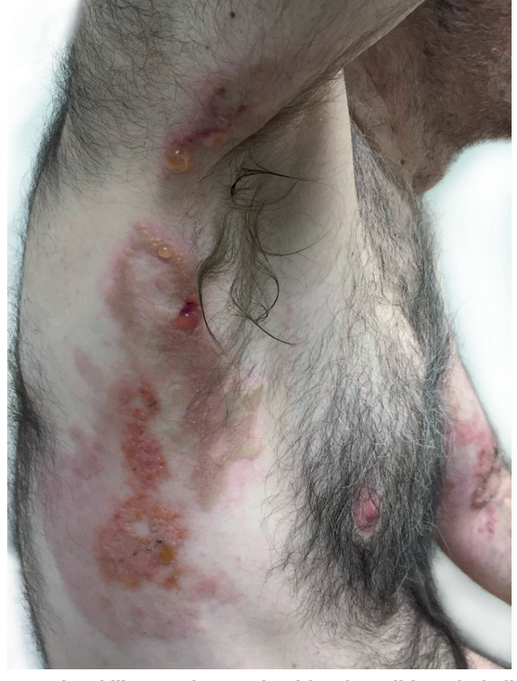
Fig. 1. Eosinophilic granulomatosis with polyangiitis and a bullous rash. Note the vesicles overlying the oedematous plaques.

On admission, the patient was afebrile. Physical examination revealed expiratory wheezes over both lung fields and a symmetrical blistering figurate eruption involving the axillae, inner arms, wrists, and lower limbs. The rash consisted of indurated and oedematous erythematous-to-orange plaques overlaid by grouped, clear-fluid, tense bullae and vesicles in a linear and annular arrangement at the periphery of the lesions (Fig. 1). Blood tests revealed an eosinophil count of 4.9 \times 10^3/\mu l . Repeated cultures and polymerase chain reaction tests from blister fluid were negative for bacterial and herpetic infections. Perilesional direct immunofluorescence showed no deposition of antibodies. Biopsy from a representative bullous lesion revealed marked oedema in the papillary dermis leading to a subepidermal blister (Fig. 2A). Throughout the dermis there were foci of eosinophilic collagen fibres with eosinophilic deposits (i.e. "flame figures"), along with