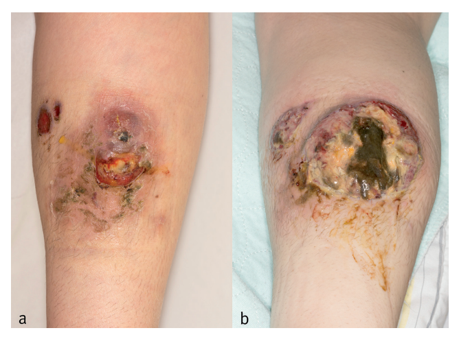
Fig. 1. (a) Lower right leg with 2 partially ulcerated lesions measuring approximately 3 cm and 6 cm in diameter. (b) Six weeks later the lesions measured approximately 4 cm and 10 cm in diameter, with a purulent exudate, slightly undermined borders and livid discoloration of the perilesional skin.

What is your diagnosis? See next page for answer.