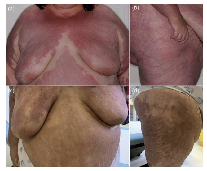
Fig. 1. Clinical photographys at the time of breast cancer diagnosis, showing symmetrically large erythematous papulous plaques involving : (a) chest; (b) thigh, after 2 cycles of neoadjuvant chemotherapy for breast cancer with residual post-inflammatory pigmentation involving the same locations as the initial lesions: (c) chest and (d) thigh.

The clinical presentation of this patient was atypical for GA, with large erythematous papulous plaques with an active border, involving a large skin surface. The lack of annular disposition was particularly puzzling; nevertheless, non-annular lesions are usual in the generalized variety of GA (1, 2). The diagnosis of multicentric reticulohisticytosis (MRH) could also have been suspected because of concomitant polyarthritis and association with tumoural syndrome. Indeed, this rare systemic