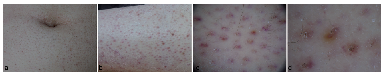
Fig. 1. a, b: Perifollicular, hyperkeratotic papules. c, d: Contact non-polarized dermatoscopy: coiled hairs surrounded by a violaceous halo.

What is your diagnosis? See next page for answer.