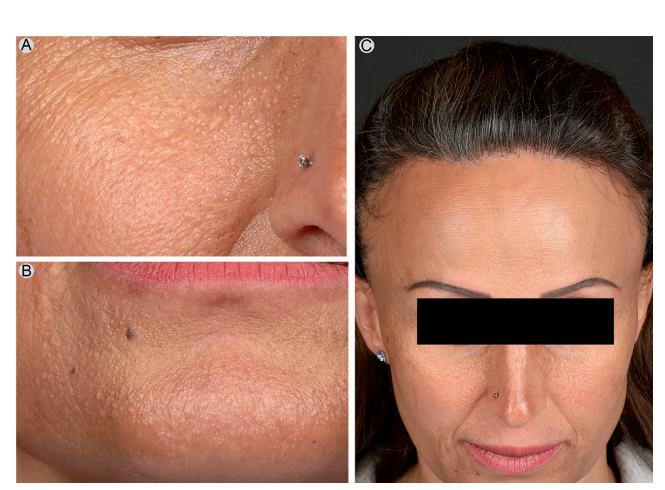
Fig. 1. (a, b) Close-up of the papules on (a) infraorbital and (b) perioral regions. (c) Receding frontoparietal hairline with keratotic follicular papules on the frontal line. Eyebrow hair loss concealed by permanent make-up.

What is your diagnosis? See next page for answer.