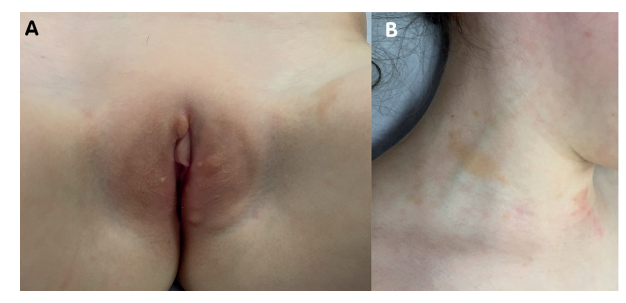
Fig. 1. (A) Nodules on the vulva and plaque on the thigh. (B) Plaques on the neck.

A skin biopsy of a nodule was performed (Fig. 2).