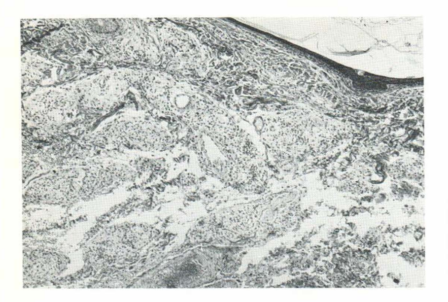
Fig. 5. Higher power view of part of Fig. 3. Masses of xanthoma cells, mostly arranged perivascularly, are present beneath the deepest part of the dilated follicular structure ( \times 90).

findings ruled out other possible pathological changes in the skin, including naevus comedonicus, naevoid follicular epidermolytic hyperkeratosis. acne vulgaris, familial comedones, acne venenata, acne medicamentosa, and comedones after injury to pilosebaceous follicles by ionizing radiation, or in pseudoxanthoma elasticum (1). Trichofolliculoma has rather similar pathological findings, but exhibits clinically a wool-like tuft of immature hair emerging from a central orifice and the lesions are usually solitary (4, 5). The pathological mechanism of comedones in this patient is unknown. The fact that the comedones were confined to the xanthelasma lesions suggests a close relationship between the comedones and xanthelasma. There are two possible explanations for this relationship. First, loose connective tissue around the pilosebaceous unit which was replaced by xanthoma cells might have induced dilation of hair follicles, resulting in the formation of comedones. Second, the destruction of pilosebaceous structures by surrounding xanthoma cells and subsequent abnormal repair of hair follicles might give rise to comedones. In addition, the decrease in elastic fibres throughout the dermis might be involved in the formation of comedones in this case.