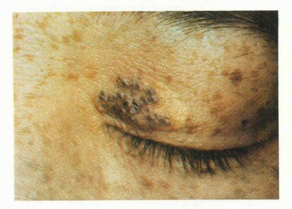
Fig. 2. Higher power view of comedones on the left upper eyelid.

Results of physical examination, apart from skin lesions, were normal. She has had light-brown, pigmented macules, so-called freekles, scattered on the face since she was around 15 years old. A yellowish plaque measuring 1\times3 cm was seen on the inner region of each upper eyelid (Figs. 1 and 2). There were about 20 and 10 come-