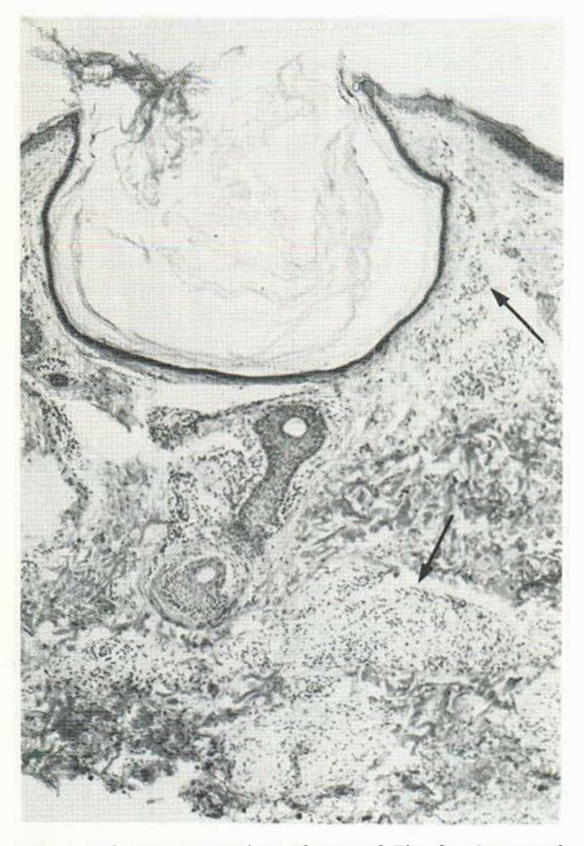
Fig. 4. Higher power view of part of Fig. 3. Masses of xanthoma cells ( arrows ) are present around and beneath the dilated follicular structure ( \times 90).

dones confined to the yellowish plaques of the left and right upper eyelids respectively. These ranged from pinpoint-sized dark papules to larger papules measuring up to 5 mm in diameter, with a central acuminate keratotic plug displaying a crateriform appearance (Fig. 2). The papules were devoid of inflammatory changes. There