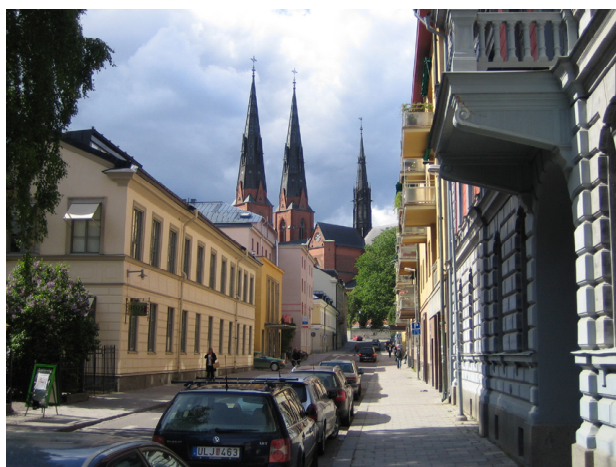
Fig. 1. Uppsala, Trädgårdsgatan, with the Uppsala dome in the background.

Over this 10-year period 40 regular numbers (about 1300 pages) have been published. We have also produced 8 supplements (about 400 pages):