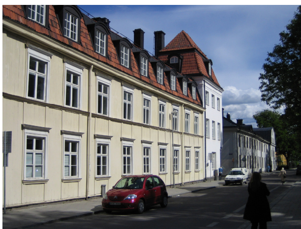
Fig. 2. Uppsala, Trädgårdsgatan 14, the building housing the editorial office of Forum for Nordic Dermato-Venereology and Acta Dermato-Venereologica .