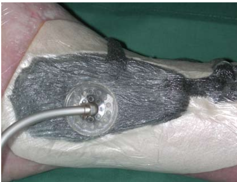
Fig. 3. Vacuum assisted closure (VAC) is used to remove oedema around the ulcer, debride the ulcer, and to increase the granulation tissue.

In infected ulcers or wounds with a heavy load of bacteria, especially Pseudomonas aeruginosa , dressings with antimicrobial properties may be of value. In clinically infected ulcers with cellulitis systemic antibiotics should be given and the antimicrobial dressing could be used as a supplement.