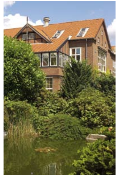
Fig. 6. Bispebjerg Hospital Department of Dermato-venereology, out patient clinic.