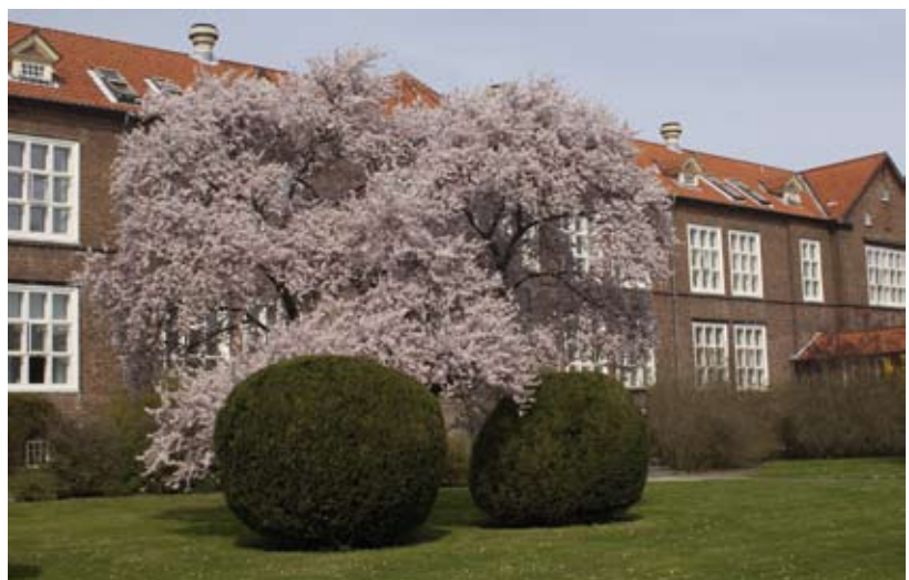
Fig. 7. Bispebjerg Hospital Department of Dermato-venereology at springtime, as seen from the garden.