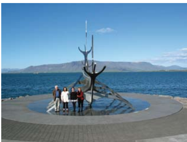
Fig. 4. Solfarið. The Sun-ship: a fine sculpture and a magnificent view-point over the bay and mountains around Reykjavik.

and up towards the hydroelectric dam, where you will be rewarded by a lovely view of the waterfall.