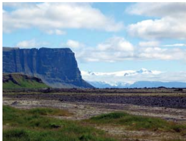
Figs. 2 and 3. Nupsstadaskogur and Lomagnupur. The landscape in the south of Iceland.