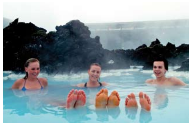
Fig. 1. Blue Lagoon. Venue for the Congress dinner.