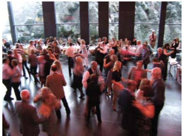
Fig. 6. After dinner dance.

Lastly, I would like to thank all participants for making this Congress what it was, whether you were lecturing, listening or otherwise engaged in this event.