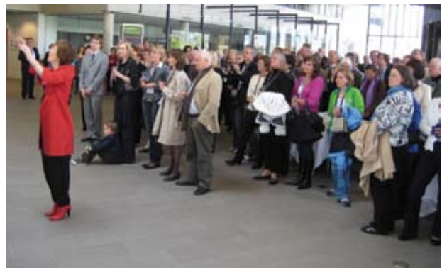
Fig. 2. The audience is spellbound by the university female choir at the opening ceremony.