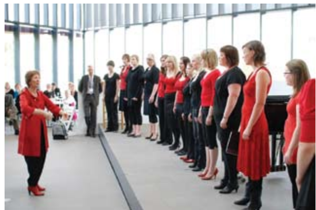
Fig. 3. The Iceland University female choir.