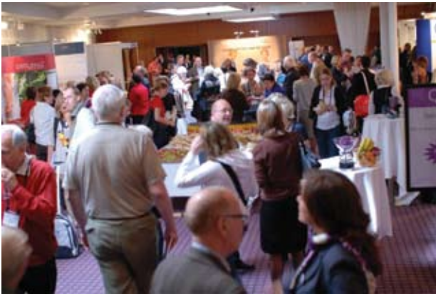
Fig. 4. Hustle and bustle at the congress exhibition.

One special opportunity was the excellent course on dermatopathology, with a self-assessment workshop appended. Dermatopathologists from the western hemisphere offered this chance for the average “derm” to catch up.