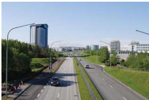
Fig. 1. A fine mornings walk to the congress venue.