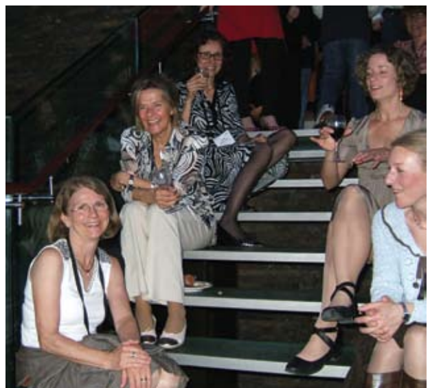
Fig. 7. After dance rest.