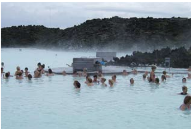
Fig. 5. Dermatologists enjoy the Blue Lagoon.

No congress is complete without a banquet. I hope and feel that the congress dinner event at the Blue Lagoon left no one disappointed, and have as my reference the photographs showing Nordic dermatologists eating, dancing and generally having a good time. The excellent photographs were taken by Anders Grängsjö from Uppsala, who kindly took it upon