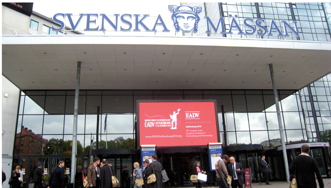
Fig. 1. Participants entering the Swedish Exhibition and Conference Centre in central Gothenburg.

The 19 th EADV Congress was kick-started on the morning of the first day with approximately 20 satellite meetings of various sub-specialty societies within the EADV. Thereafter, the official programme got under way with various symposia, workshops, forum sessions and even a course on dermatopathology. The inauguration day was rounded off that evening with fun and entertainment during the opening ceremony in the main congress hall. Professor Olle Larkö, Congress President, and the President of the EADV, Professor Andreas Katsambas, cordially welcomed all attendees to start the show. The soiree included a screening of the film Gothenburg – We Love You and live musical performances by an ABBA tribute band and the talented master of ceremonies, Fredrik Swahn. After the ceremony, attendees had the opportunity to mingle and dine with colleagues and friends in a relaxed atmosphere during a reception in the exhibition hall.