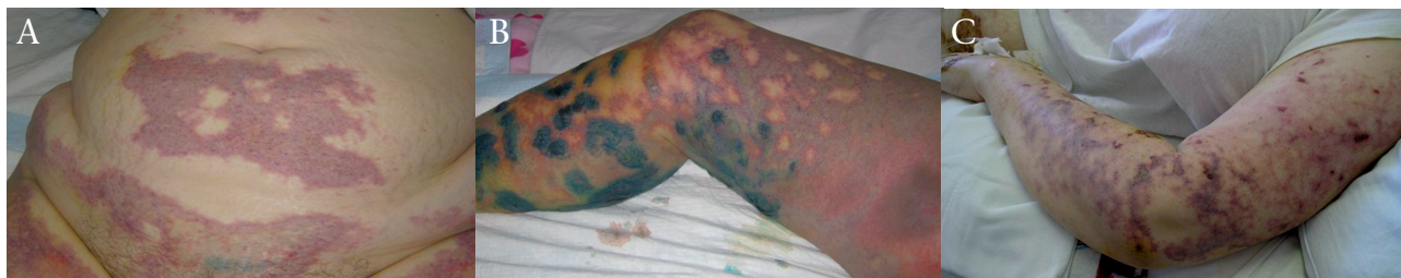
Fig 1. Extensive purpura lesions in the patients' (A) abdomen, (B) legs, and (3) arms.

seen on body computed tomography (CT)-scan, echocardiography, Doppler study of the extremities, or brain magnetic resonance imaging (MRI).