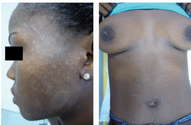
Fig. 1. Pityriasis rosea in a young girl. The rash appears grayish but the topography and the aspects are still typical of pityriasis rosea. Note the medalion in the left cheek that helped to make the diagnosis.

Lastly, skin bleaching is a widespread practice especially among sub-Saharan immigrants. Women mainly practice skin bleaching for various reasons: to obtain radiant skin, to get a better social status including jobs and marital prospects or because of social pressure such as westernised beauty ideals. Abuse of depigmentating agents such as hydroquinone, potent or ultra potent corticosteroids or other homemade concoctions leads to a high prevalence of disfiguring dyschromia. Cutaneous complications related to hydroquinone use are periorbital pigmentation, exogenous ochronosis, vitiligo mottled-like hypopigmentation, lupus-lichen lesions and even maybe skin cancer. The abuse of corticosteroids leads to cutaneous infections such as tinea, acne, stretch marks, skin atrophy and