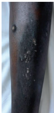
Fig. 2. Prurigo nodularis in an HIV patients. Typical annular pigmented itchy lesions with central depigmentation.