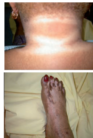
Fig. 3. Heterogenous depigmentation induced by skin bleaching agents.

systemic complications. As users tend to hide the use of such agents to the physician it is important to treat any underlying skin dermatoses, disrupt bleaching agents, avoid any judgemental approach and educate about the risks of such practice.