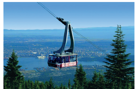
Majestic North Shore.