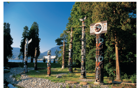
Stanley Park Totem Poles-TVan large.