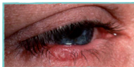
Fig. 4. Ocular rosacea (Photo: Galderma®).

The definition of ocular rosacea is even less stringent than that of cutaneous rosacea. The diagnosis depends on inflammatory findings due to disturbance of the function of the Meibomian glands and telangiectasias. There is no reliable diagnostic test for ocular rosacea. Since many ophthalmic and dermatological diseases can present with similar inflammatory reactions to that of ocular rosacea the diagnosis relies on careful investigation and follow-up, and the collaboration of ophthalmologists and dermatologists. The lack of stringent diagnostic criteria for ocular rosacea probably also reflects the varying prevalence of this condition, with 6–72% of rosacea patients affected (15, 16).