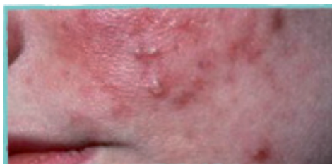
Fig. 2. Papulopustular rosacea.