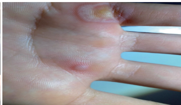
Fig. 2. Left hand, 6 th of April.