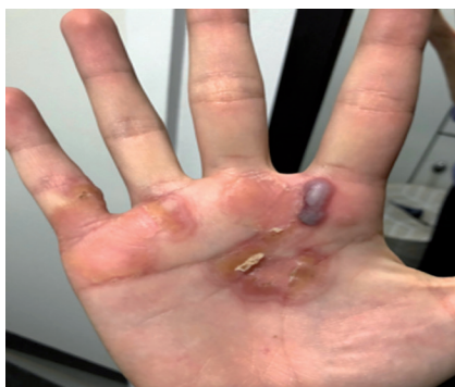
Fig. 1. Right hand, 6 th of April.

started until the 3 rd of April. Almost at the same time as the dry cough the boy developed skin lesions. The skin lesions were mildly pruritic symmetric erythematous papules developing to vesicles located on the hands. On the 13 th of April the pulmonary symptoms worsened and he was admitted to the paediatric department. The tentative diagnosis was asthma exacerbation. The chest X-ray was normal, and the throat swab and tracheal aspirate for COVID-19 was negative. The tracheal secretion culture was negative for bacteria causing atypical pneumonia (mycoplasma, legionella, chlamydia) but positive for Moraxella catarrhalis , and he was treated with amoxicillin/clavulanic acid in tablet form for a 10 day period. The blood test showed only mildly neutrophilia 7.8 mmol/l, and a normal C-reactive-protein (CRP). A lung function test revealed a drop in FEV-1 to 45% of what was expected (FEV-1 76% of what was expected in November 2019). Because of the severe pulmonary symptoms, he was treated with 50 mg prednisolone daily for one week. After a week of hospitalization, he was discharged with increased doses of asthma medication.