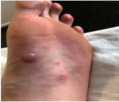
Fig. 3. Left foot, 5 th of June.