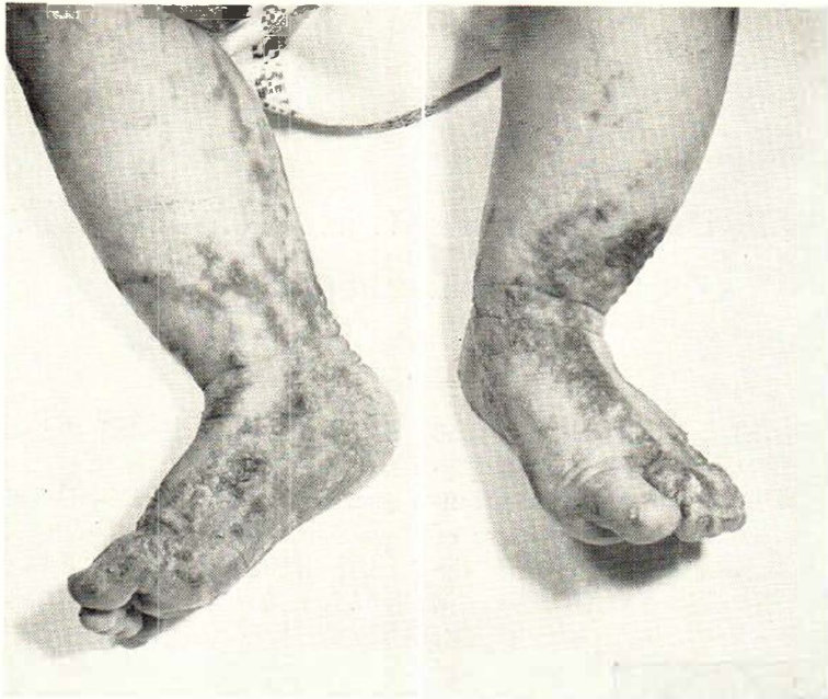
Fig. 1. Pigmented hyperkeratoses at the age of 5 months.