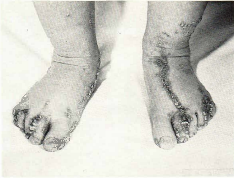
Fig. 3. Pigmented hyperkeratoses at the age of 2 years.

to those originally present. In the right popliteal and gluteal regions, weakly pigmented spots and streaks without infiltration were noticed, and in the skin of the posterior crural regions there were spots and streaks of reddish brown pigment at the level of the skin proximally, but with verrucous infiltrations peripherally. On renewed follow-up examination at the age of 2 years, the distribution of the lesions was practically unchanged, but the verrucous hyperkeratoses had become more prominent and had assumed a more pronounced greyish black pigmentation (fig. 3).