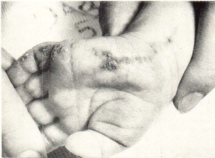
Fig. 2. Pigmented hyperkeratoses at the age of 5 months.

hyperkeratoses running in irregular streaks longitudinally on the extremities. The distribution of the affection was symmetrical, and a few vesicles were still present. At the age of 5 months, the patient was admitted to our department for further investigation.