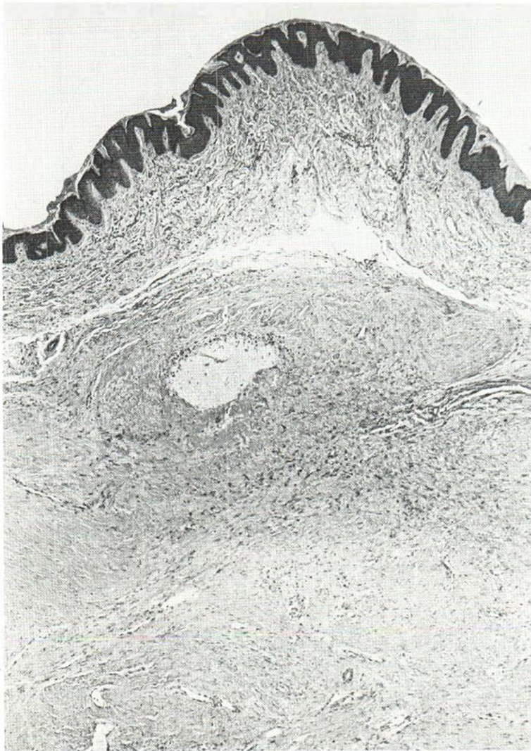
Fig. 2. Hypertrophic scar with a small, well circumscribed area of mucinous material and peripheral inflammatory reaction. Hematoxylin and eosin, \times 35 .

nature of the material in that study. Furthermore, their patient was injected with hydrocortisone for 'tennis elbow'. The underlying basic pathology may have been different. Even though rheumatoid nodule may have to be considered in the differential diagnosis of a lesion such as shown in this study, the presence of fibrin has not been demonstrated in our study. Nor did Santa Cruz & Ulbright (4) observe a similar change in keloids, in a review of a large number of cases.