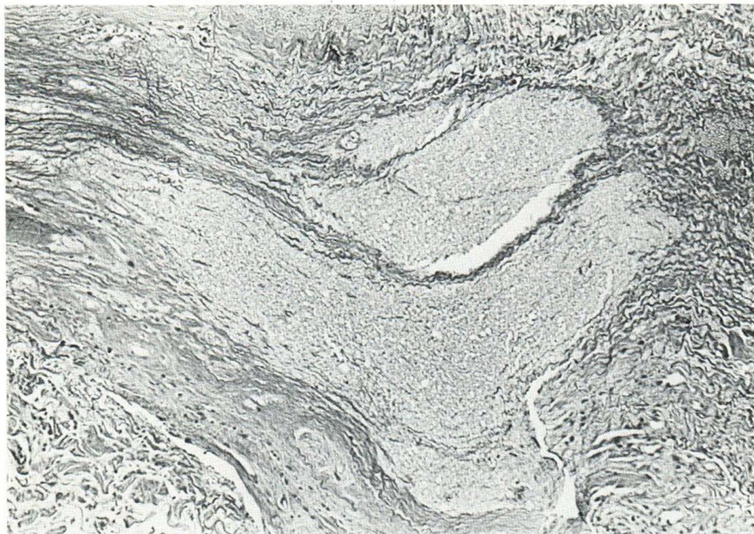
Fig. 1. Photomicrograph shows large pools of mucinous material without inflammatory reaction at the periphery. Hematoxylin and eosin, \times 88 .

excisional biopsy one week after the last injection. The biopsy was processed for light microscopy and 5- \mu\text{m} paraffin wax-embedded sections were cut and stained with hematoxylin and eosin, PAS (with and without Diastase), alcian blue at pH 1.0 and 2.5 (with and without hyaluronidase), Masson's trichrome, colloidal iron, mucicarmine and stain for fibrin.