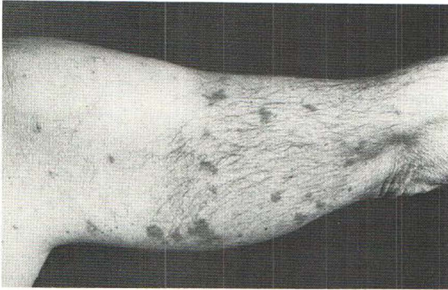
Fig. 1. Papular secondary skin manifestation in a patient with pulmonary tularemia. Typical small papules are seen in the shoulder region. The larger lesion on upper arm closely resembled erythema multiforme.

Skin biopsies for histopathological and immunohistological examination were taken from two patients with papular lesions and one with erythema multiforme.