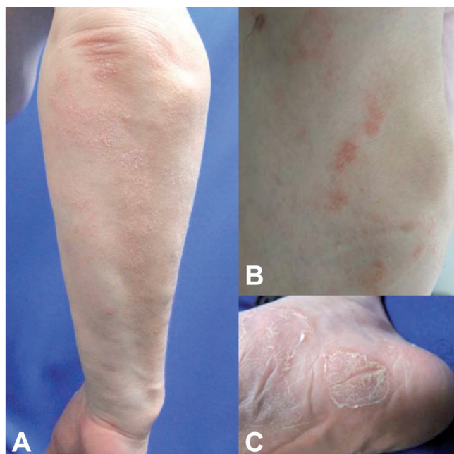
Fig. 1. Clinical features of the skin lesions. (A and B) Erythematous plaques with scales are distributed on the extensor surfaces of the extremities. (C) Keratotic erythematous plaques on the soles.

Abatacept is a dimeric, soluble, fusion protein consisting of an extracellular binding domain of human cytotoxic T-lymphocyte antigen 4 (CTLA-4) and human IgG. It blocks the binding of CD28 to CD80/CD86, thereby inducing the down-regulation of T-cell