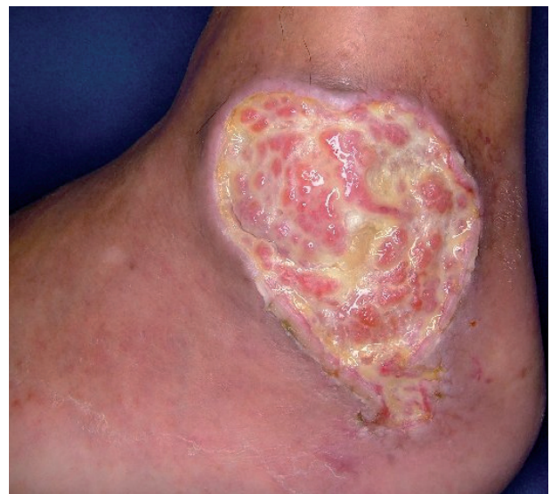
Fig. 1. Left foot with an ulcer on the lateral malleolar area after two months free of hydroxyurea administration. The ulcer was covered with yellow necrotic tissue and surrounded by oedematous erythema.

HU is usually well tolerated and has low toxicity (1). However, cutaneous adverse effects such as diffuse hyperpigmentation, brown discoloration of the nails, acral erythema, photosensitization, fixed drug eruption, alopecia, and oral ulceration have been reported (7–9). Stahl & Silber (10) first reported HU-induced skin ulcers in 1985. Montefusco et al. (11) reported