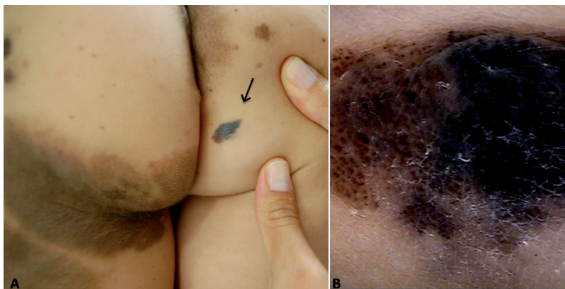
Fig. 2. (A) Melanoma arising in congenital giant melanocytic naevus. (B) Dermoscopic features.

of melanoma in the general population between the age of 10 and 14 years is 0.5% per 100,000 per year (4).