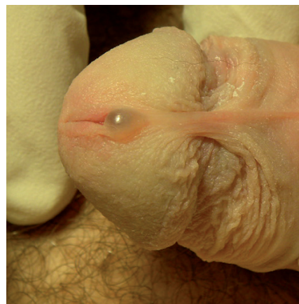
Fig. 1. An 8 mm wide bluish cystic lesion at the urethral meatus.

Apocrine hidrocystomas are benign tumors most often seen in adults aged 30 to 70 and rarely during childhood or adolescence. They are generally single, but can also