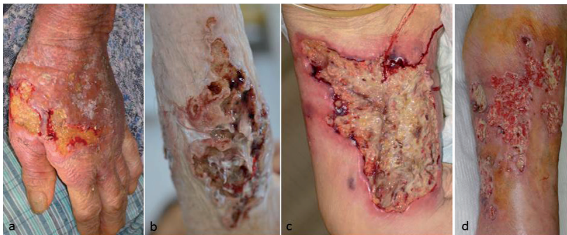
Fig. 1. Deep ulcerations on the (a) dorsa of the hand (Case 1), (b) lower leg (Case 2) (c) thigh (Case 3) and (d) lower leg (Case 4).

Case 4. A 79-year-old woman presented with an ulcer on the left lower leg of two months' duration. She had been treated at a clinic, but the ulcer spread. She was also suffering from rheumatoid