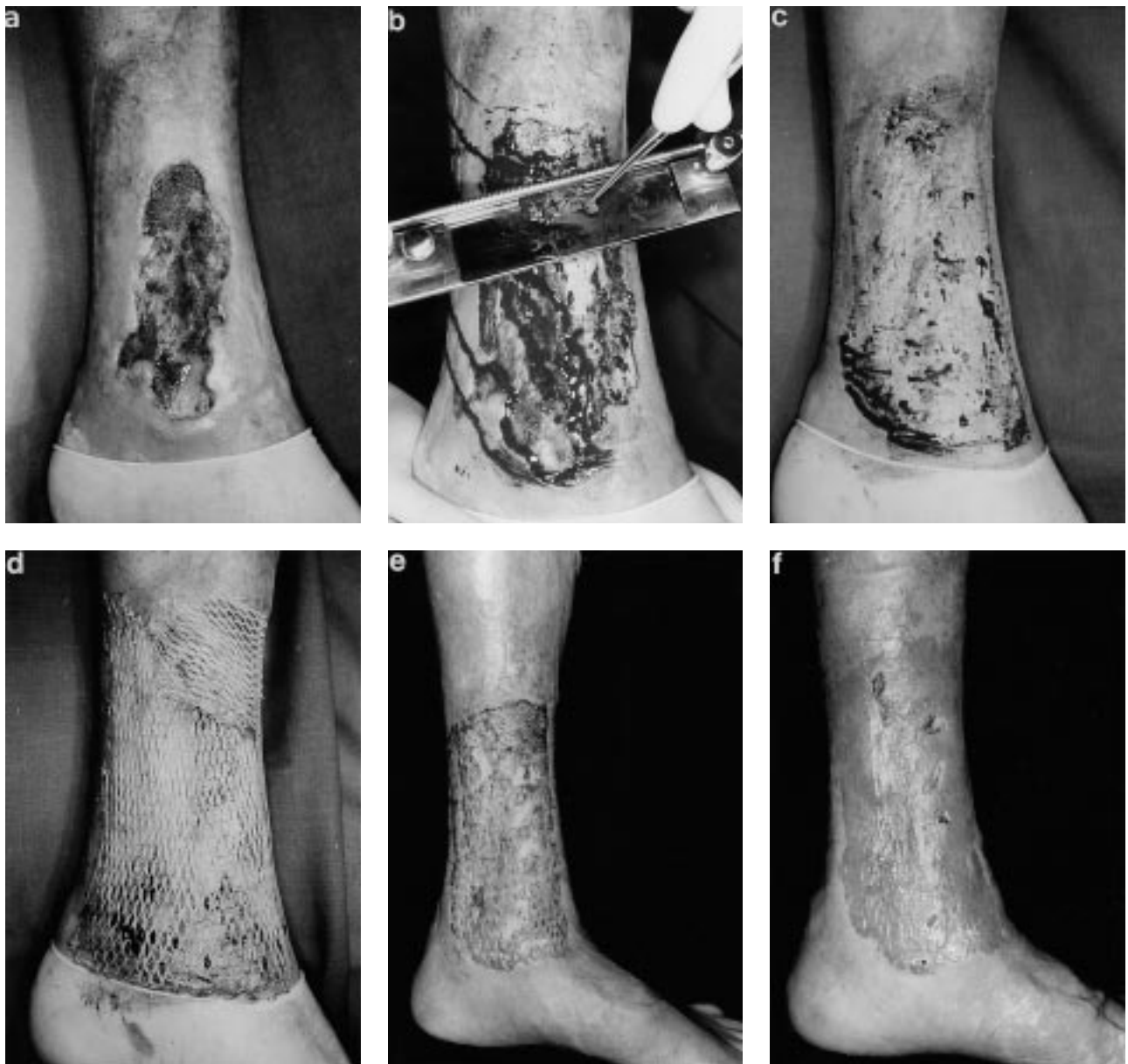
Fig. 1. Shave therapy operative procedure: (a) 66-year-old male with deep venous insufficiency in post-thrombotic syndrome. Leg ulcer of 11 years duration; (b) removal of ulcer and the surrounding lipodermatosclerosis with a Schink skin-grafting knife; (c) wound bed after shave therapy; (d) split-skin graft at the end of the operation; (e) result 2 weeks later; (f) result after 3 months, healing not yet complete.

Thirty-four patients were seen in March and April 1998. Seven had