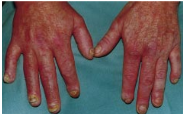
Fig. 1. Pustules, subungual hyperkeratosis and onycholysis after a third degree burn of the right hand. Note normal skin and nails on the contralateral side.