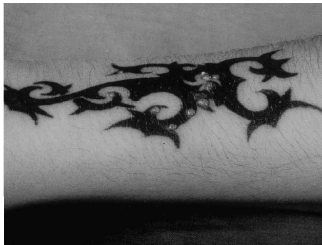
Fig. 1. Papules limited to within the area of the tattoo.

The practice of tattooing can transmit, albeit rarely, some severe systemic infectious diseases, such as hepatitis B and C (1–14), acquired immunodeficiency syndrome (AIDS) (15), tetanus (1, 10) and septicaemia (1). Several infectious diseases of the skin can also be transmitted, in particular warts (1, 6, 14, 16–18), but also rubella (10), vaccinia (1), impetigo (1, 10), erysipelas (1, 10), ecthyma (1, 10), cellulitis (1, 10), gangrene (1), chancroid (1, 10), syphilis (1, 6, 10, 14), cutaneous tuberculosis (1, 6, 10, 14, 18) and leprosy (1, 10, 14, 19–21). To our knowledge, only one previous case of