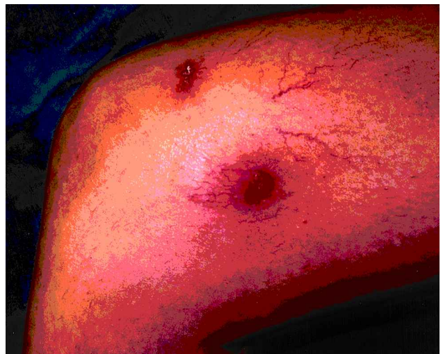
Fig. 1. Two subcutaneous nodules on the right thigh of patient 1. The nodules were purple, tender and painful on pressure.

Treatment with minocycline (100 mg/12 h) was given for 3 weeks with no response. Monotherapy with cotrimoxazole (800/160 mg/12 h) for 3 weeks was also unsuccessful. Then a regimen with ciprofloxacin (500 mg/12 h), clarithromycin (500 mg/12 h) and amoxicillin–clavulanic acid (500 mg/12 h) for 3 weeks followed by 3 months with clarithromycin (500 mg/12 h) was given according to the results of the drug susceptibility study. Forty-eight hours after starting the treatment, the patient developed a rash; consequently all drugs were stopped and restarted consecutively at intervals of 3 days. Ciprofloxacin was