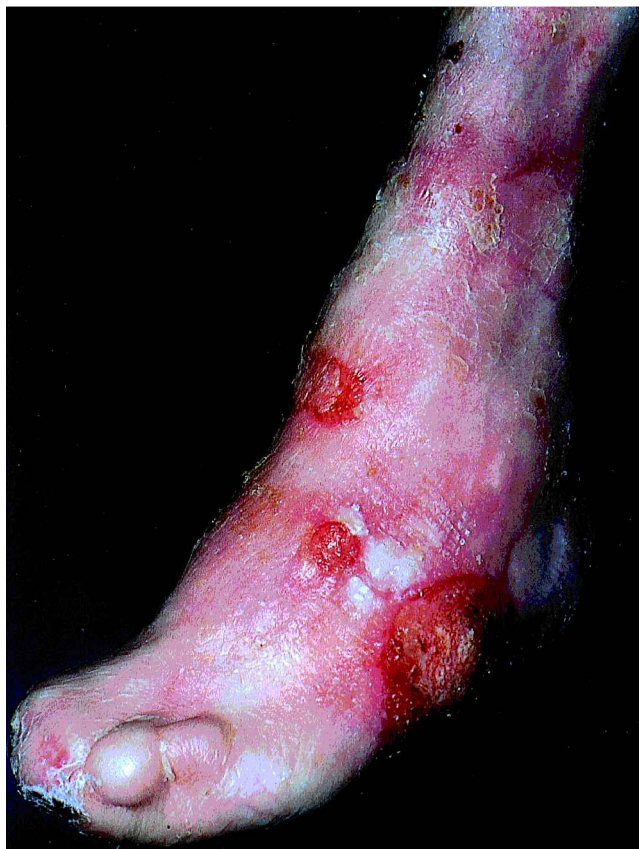
Fig. 1. Exophytic tumour on the left foot of patient 2. Histopathology revealed a squamous cell carcinoma.

At the age of 33 years the patient was admitted to hospital because of a hypertrophic granulomatous lesion in scar tissue of the right prepatellar region (Fig. 3) which had developed after a trauma a few months earlier. Biopsy revealed a well-differentiated SCC and the tumour was surgically removed. After biopsy, multiple lymph nodes of the right inguinal region were found to be enlarged, suspicious for reactive lymphadenopathy or metastatic disease. In order to differentiate between an inflammatory process alone, as often occurs in patients with EB, and an additional lymph node metastasis a sentinel lymph node biopsy was performed. Histopathology of the lymph node