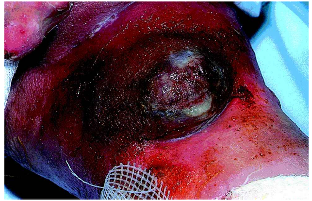
Fig. 2. Metastatic tumour tissue on the left proximal thigh of patient 2 at the time of presentation with the primary tumour.

Case 3. A 33-year-old woman had developed severe persistent bullous eruptions of the skin and oral mucosa soon after birth. In her family one of her two brothers suffered from the same disorder. Owing to scarring with milia formation, pseudosyndactyly, complete loss of nails and scarring alopecia, the diagnosis of RDEB-HS was made and confirmed by electron microscopy (dermal cleavage and rarefication of anchoring fibrils). In the course of the disease the patient suffered from dysphagia due to oesophageal strictures, scarring of genital skin and mucosa with contraction of the introitus vaginae, chronic erosive keratitis of both eyes with pannus formation, growth retardation