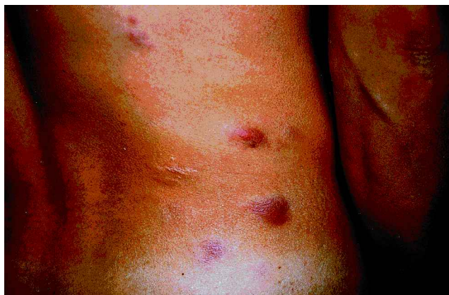
Fig. 1. Multiple erythematous nodules are evident on the back.