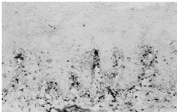
Fig. 2. Increased numbers of CD4+ T-lymphocytes in the oral epithelium and lamina propria after the 12-h gliadin challenge in a patient with dermatitis herpetiformis.

of CD8+ and alpha/beta TcR+ cells remained unaltered in the epithelium. These findings are in good agreement with those observed recently by Lähteenoja et al. in patients with coeliac disease (15, 16). They applied gliadin powder on oral mucosa with the aid of an adhesive bandage for 6–24 h and found a similar increase of the CD4+ cells in the epithelium as we did. These results show that, at least under occlusion, gliadin, which is fairly insoluble in water, can penetrate mucosa and cause an influx of immunocompetent cells. Supporting this, Lähteenoja et al. (15, 16) could also document an influx of the TcR alpha/beta+ cells and increased expression of IL-2 receptor on T cells with submucosally injected gliadin or gliadin peptides. Moreover, the present study in DH and the previous study in coeliac disease by Lähteenoja et al. (15) documented that mucosal gliadin challenge did not cause any influx of TcR gamma/delta+ cells into the epithelium, indicating that a marked difference exists between the occurrence of these cells in the oral and gut mucosa (6, 11, 18).