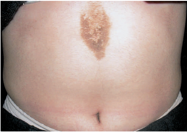
Fig. 1. Naevoid hyperpigmented verrucous velvety plaques on the midline of the abdomen including the umbilicus.

A routine laboratory evaluation, including a full blood count, serum chemistry, urine analysis and plasma glucose level, showed no abnormalities. Endocrine assessment revealed normal GH (1.96 ng/ml, normal, 0.57–4.73 ng/ml), T3 (0.93 ng/ml, normal, 0.78–1.82 ng/ml), T4 (7.59 µg/dl, normal, 4.68–12.48 µg/dl) and TSH (2.85 mU/l, normal, 0.17–4.05 mU/l) levels. Radiographic examination of the skull demonstrated no abnormal findings. A biopsy specimen of the skin lesion revealed hyperkeratosis, papillomatosis and slight acanthosis in the epidermis, and a mild perivascular lymphocytic infiltration in the superficial dermis (Fig. 2). But it also shows a relative lack of acanthosis and greater elongation of the rete ridges compared to epidermal naevi. These findings were interpreted as being most consistent with naevoid AN.