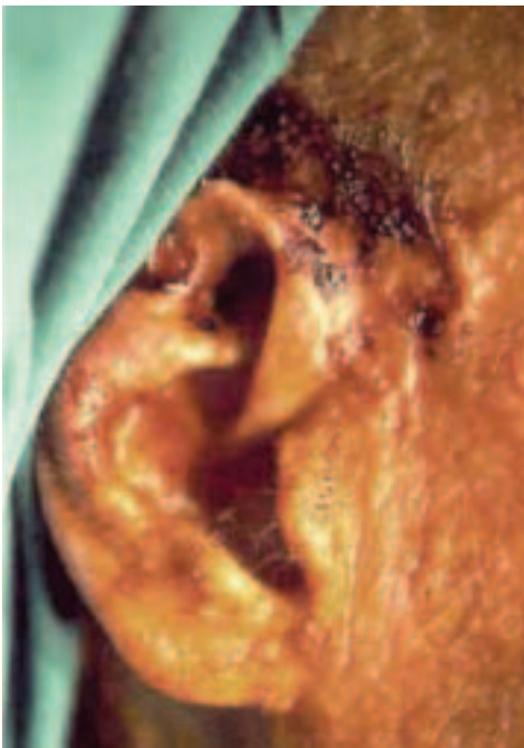
Fig. 1. Extensive basal cell carcinoma on the right auricular region.

The patient refused to undergo a cutaneous biopsy of the lesions of the face and the trunk to confirm the diagnosis. At 8-month follow-up examination, the patient was in good health, without evidence of recurrence of the skin tumour. A few months later, the patient died of bronchopneumonia. No autopsy was performed.