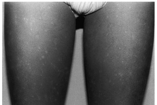
Fig. 1. Symmetrically distributed hypopigmented macules and papules over lower limbs.

The remarkable clinical similarity between PKDL and leprosy is well known. The differentiating features include predilection of PKDL lesions for the centrofacial region, absence of neurological deficit both clinically and histologically and demonstration of LD bodies in slit skin smears or histological sections. However, in various series on PKDL reported from different parts of the world, the parasite could be demonstrated by slit smears in only 20–66.6% of lesions and on histopathology, the detection rate was sometimes as low as 20% (6, 7). Under such circumstances, establishing the diagnosis of PKDL and