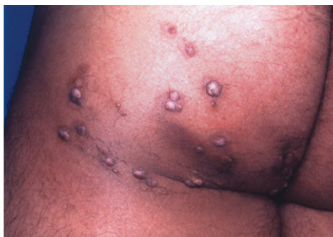
Fig. 1. Skin-coloured, soft to firm papules and plaques of naevus lipomatosus cutaneus superficialis on the left gluteal region.

of NLCS for the gluteal lesions and angiokeratoma of Fordyce for the scrotal lesions were made. His routine baseline investigations (complete blood count, clinical chemistry, urinalysis, chest X-ray) were normal. Excision biopsy of one of the lesions on the gluteal region showed mild irregular acanthosis, and groups of fat cells embedded within the collagen bundles of the papillary, mid- and lower dermis (Fig. 3). Focal dermal perivascular mononuclear infiltrate was also noted. The findings were consistent with the diagnosis of NLCS. The patient did not consent to biopsy of the scrotal lesions and refused surgical excision or electrocautery