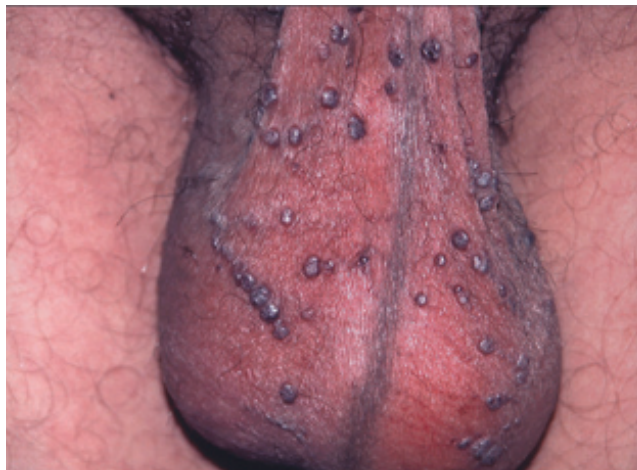
Fig. 2. Vascular papules of angiokeratoma of Fordyce on the scrotum of the same patient.

A 43-year-old man had multiple asymptomatic skin-coloured lesions on his left gluteal region for 25 years, and multiple asymptomatic dusky red vascular papules on his scrotum for the last 10 years. Both types of lesions had increased slowly in numbers and size. He had no systemic complaints. There was no history of similar lesions in the family. The patient had undergone surgical excision of some of the gluteal lesions 15 years earlier. Cutaneous examination revealed multiple, skin-coloured, soft to firm, lobulated and smooth surfaced papules and plaques on his left gluteal region, 0.5–2.0 cm in size (Fig. 1). An irregular large atrophic scar from previous surgery was present on the adjacent perianal skin. In addition, he had multiple, 2–3 mm, firm vascular papules on the scrotum (Fig. 2). Clinical diagnoses