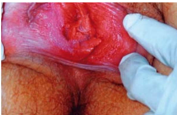
Fig. 1. Diffuse whitening of vestibular papillae following lavage of the labia minora with 5% acetic acid.

Histologically, the papillary fronds consisted of squamous epithelium characterized by papillomatosis, acanthosis and focal parakeratosis. Within the fibrous stroma, the capillaries were congested. A small number of lymphocytes and plasma cells were present. Additionally, many cells with a clear perinuclear halo, probably glycogenated cells, mimicking koilocytes were observed (Fig. 2). However, the lack of clear-cut nuclear atypia did not permit the identification of these cells as koilocytes. There was no evidence of papillomavirus antigens in the nuclei of koilocytes by immunohistochemical technique (polyclonal human papillomavirus (HPV) stain, DAKO, USA). Polymerase chain reaction (PCR) technique for HPV could not be performed because of the cost of this technique to the patient. The patient's husband did not show clinical features of genital HPV infection.