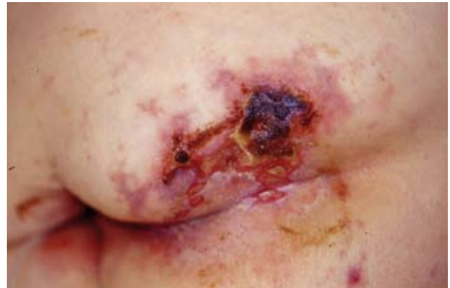
Fig. 1. Necrotizing livedo of the perineal area.

Anticoagulant therapy was then introduced without any significant clinical improvement and the livedo slowly spread during the following month, resulting in severe necrotic lesions while small, painful ulcerations of the legs and weakness of the lower limbs appeared as well. In the meantime, intellectual alterations quickly worsened with increasing negligence without any evidence of brain metastasis, cerebral infarct, neoplastic, viral or