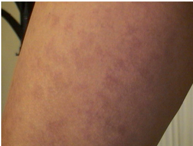
Fig. 1. Erythematous-telangiectatic lesions on the medial aspect of the right thigh.

A 10-year-old boy presented erythematous-telangiectatic lesions dermatomally distributed on the internal surface of the right thigh, resembling a naevus flammeus (Fig. 1). The lesions first appeared when the boy was 7 years old and progressively increased in size to the entire right thigh surface, causing no other symptomatology. His medical history was unremarkable. Physical examination revealed no other skin alteration and no clinical findings were suggestive for a hyper-oestrogenaemic state. Routine laboratory studies, liver function tests, antibodies to hepatitis A, B and C, levels of oestrogen, progesterone, testosterone and dehydroepiandrosterone were within normal limits. Abdominal ultrasonography was also normal. The histological evaluation of a lesional skin sample revealed ectasia of the superficial and medium