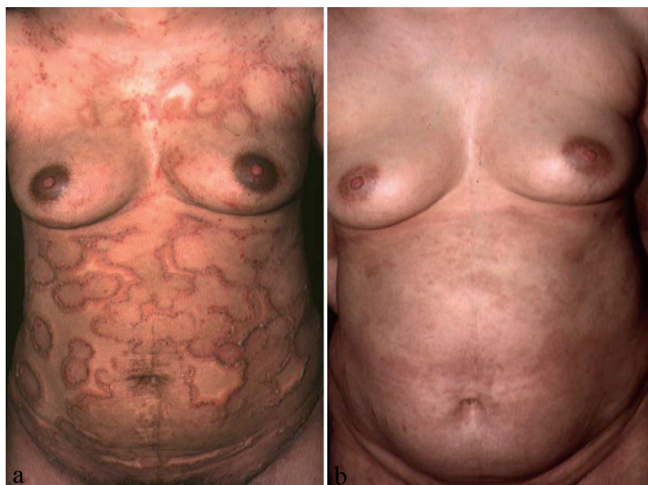
Fig. 1. (A) Numerous erythematous-oedematous figured lesions, with grouped vesicles and bullae just after post-partum. (B) Complete resolution of lesions after 4 cycles of IVIg.

A 31-year-old woman developed pruritic erythematous-oedematous figured papular lesions on the second day after delivery, in her first pregnancy. Over the next 3 weeks, the eruption became widespread with the typical erythematous grouped papular eruption associated with vesicles, blisters and scaling crusts over the thighs, trunk and arms (Fig. 1A). A clinical diagnosis of PG was made. This was supported by the histopathology of a skin lesion, which showed a subepidermal vesicle, and a superficial lymphohistiocytic infiltrate with many eosinophils (Fig. 2A). Direct immunofluorescence (IF) demonstrated a bright linear deposition of C3 without IgG and IgM, along the basement membrane (Fig. 2B), and indirect IF revealed circulating anti-C3 to a titre of 1:20. Routine haematology, biochemistry and an autoantibody screen were normal.