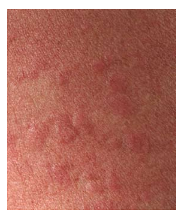
Fig. 1. Erythematous macular and partly urticarial lesions on the patient's arm in July 2006. The rash disappeared within 6h of the first application of the interleukin-1 antagonist, anakinra.

Laboratory work-up revealed the following: ESR 105 mm/h, C-reactive protein (CRP) 61 mg/dl (normal value < 0.5 mg/dl), haemoglobin 9.5 g/dl (normal 11.7–16 g/dl), mean globular volume 80.2 (normal 82–101), leukocytes 9.3 \times 10^{-3}/\mu l (normal