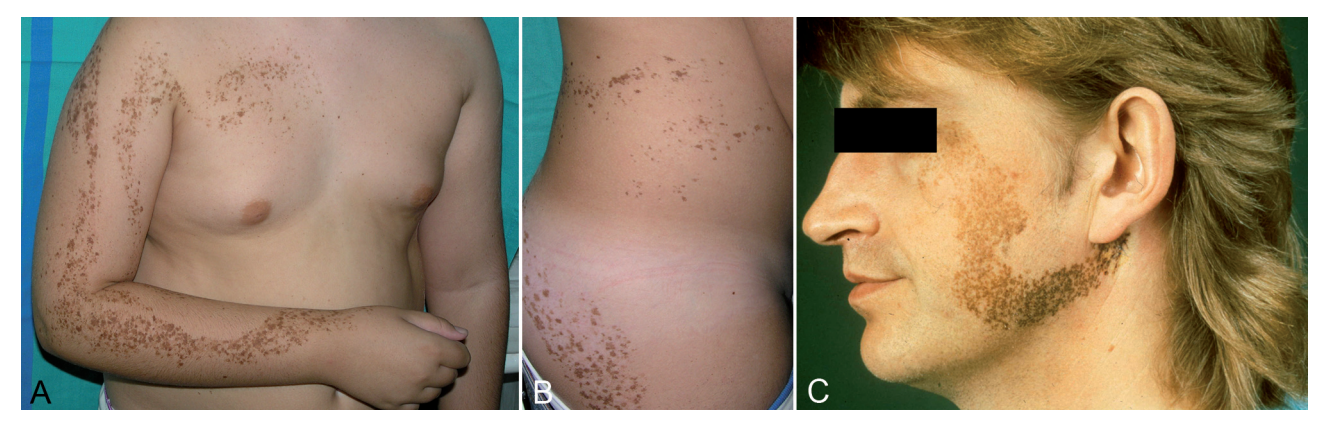
Fig. 1. Tightly packed lentigines distributed in a band-like pattern involving: (A) the right side of the thorax and the right arm; (B) the right flank (case 1); and (C) tightly packed lentigines arranged in a linear pattern (case 2).

The disorder follows Blaschko's lines and therefore clearly reflects cutaneous mosaicism (3). The condition differs from naevus spilus maculosus (2) by the absence of background hyperpigmentation and by the