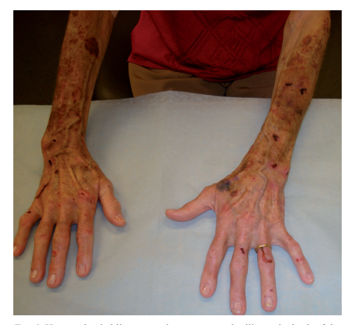
Fig. 1. Haemorrhagic blisters, erosions, crusts and milia on the back of the hands and the distal forearms of patient 1.

confirm and refine the previous diagnosis. As shown in Table I, urinary porphyrin precursors, \delta -aminolaevulinic acid (ALA) and porphobilinogen (PBG) were within the normal range. Urinary porphyrins were slightly increased. In addition, an elevated content of coproporphyrin isomer III was observed in the faeces. Plasma fluorescence emission scan identified a peak at 624–626 nm, which is characteristic for VP. Subsequent molecular analysis of the PPOX gene revealed a frameshift mutation, 1082–1083insC, stop+18, thereby confirming the diagnosis at the molecular level (data not shown).